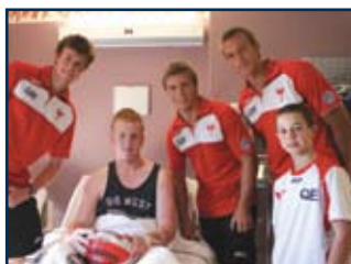
Swans players visited the Starlight Room and all patients in the Children’s Hospital

the hospital, ensuring all patients received a visit.