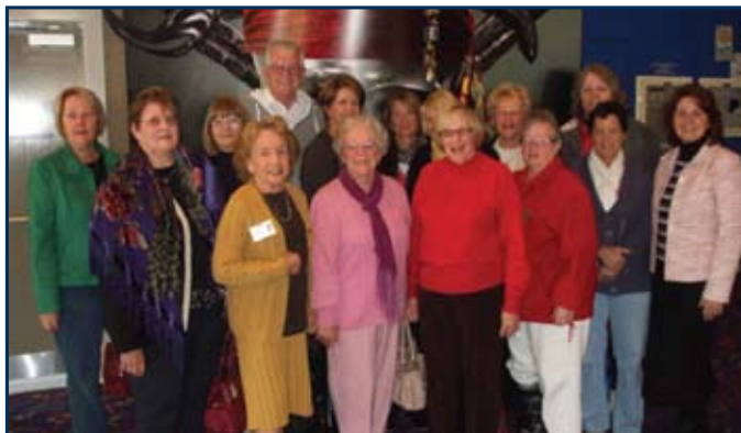
Volunteers at the movies

On Thursday 12th May, Greater Union Cinemas, Glendale offered our volunteers an opportunity for a Social Day Out at the Movies. The movie "Water for Elephants" was a huge hit... especially to those who were animal lovers!