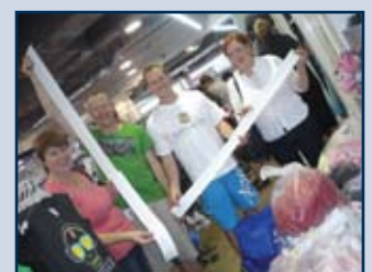
Thankfully staff weren’t required to pay the bill

Best and Less thought otherwise, donated a further $1370.41 to the NICU. The added donation brought the total to $4000.