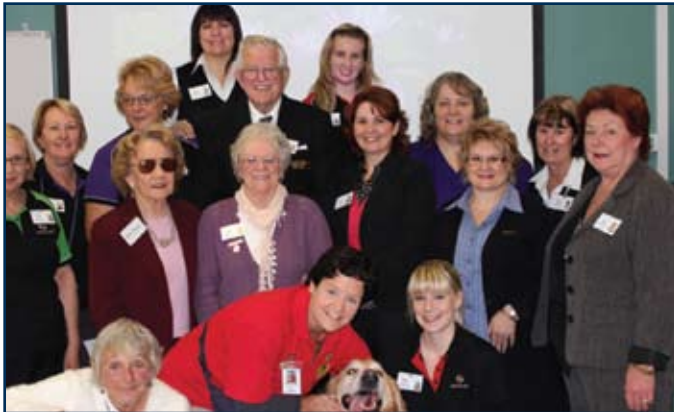
Celebrating the efforts of our volunteers