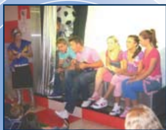
Hi5 perform in the Starlight Room

Starlight ambassadors and children’s music group Hi5 popped in to sing a few songs for patients in the Starlight Room before their show at the Civic Theatre in April.