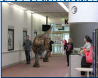
Baby T-Rex on the charge

The life like and size dinosaur roared and played with the corridor of