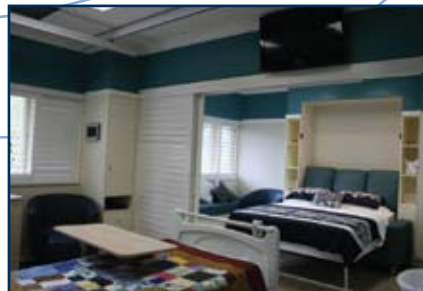
New facilities were opened in 2010 for paediatric palliative care, chronically ill patients and long term patients